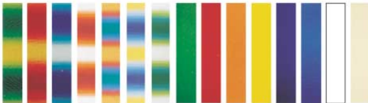
AM6010/5 AM6010/6 AM6010/2 AM6010/1 AM6010/15 AM6010/11 AM6010/7 AM6/5 AM6/9 AM6/4 AM6/14 AM6/1 AM6/62 AM6/20 AM6/10