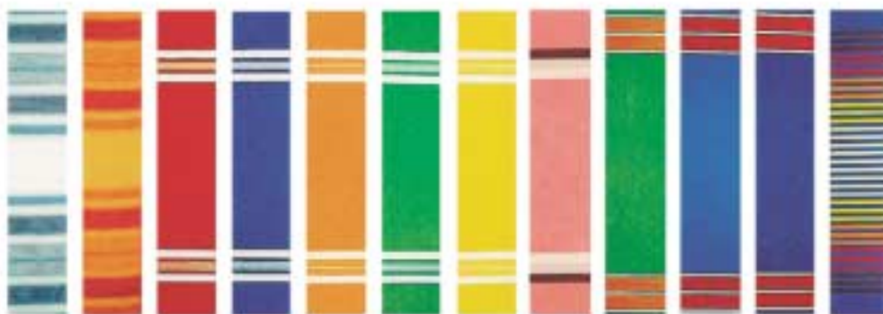
NRT54/1 NRT54/2 NRT17/4 NRT17/6 NRT17/2 NRT17/3 NRT17/1 NRT56/1 MR25 MR26 MR21 SR31