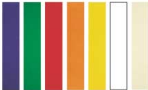
Blu Verde Rosso Arancio Giallo Bianco Beige